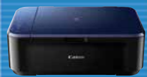
PIXMA Ink Efficient E560