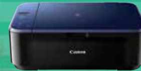
PIXMA Ink Efficient E510