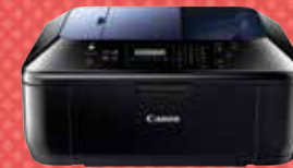
PIXMA Ink Efficient E610