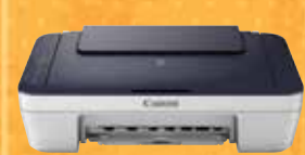
PIXMA Ink Efficient E400